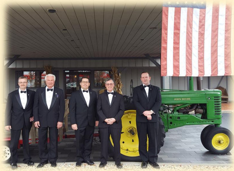
Part of the Color Guard, 4 th Degree Exemplification, October 29, 2016