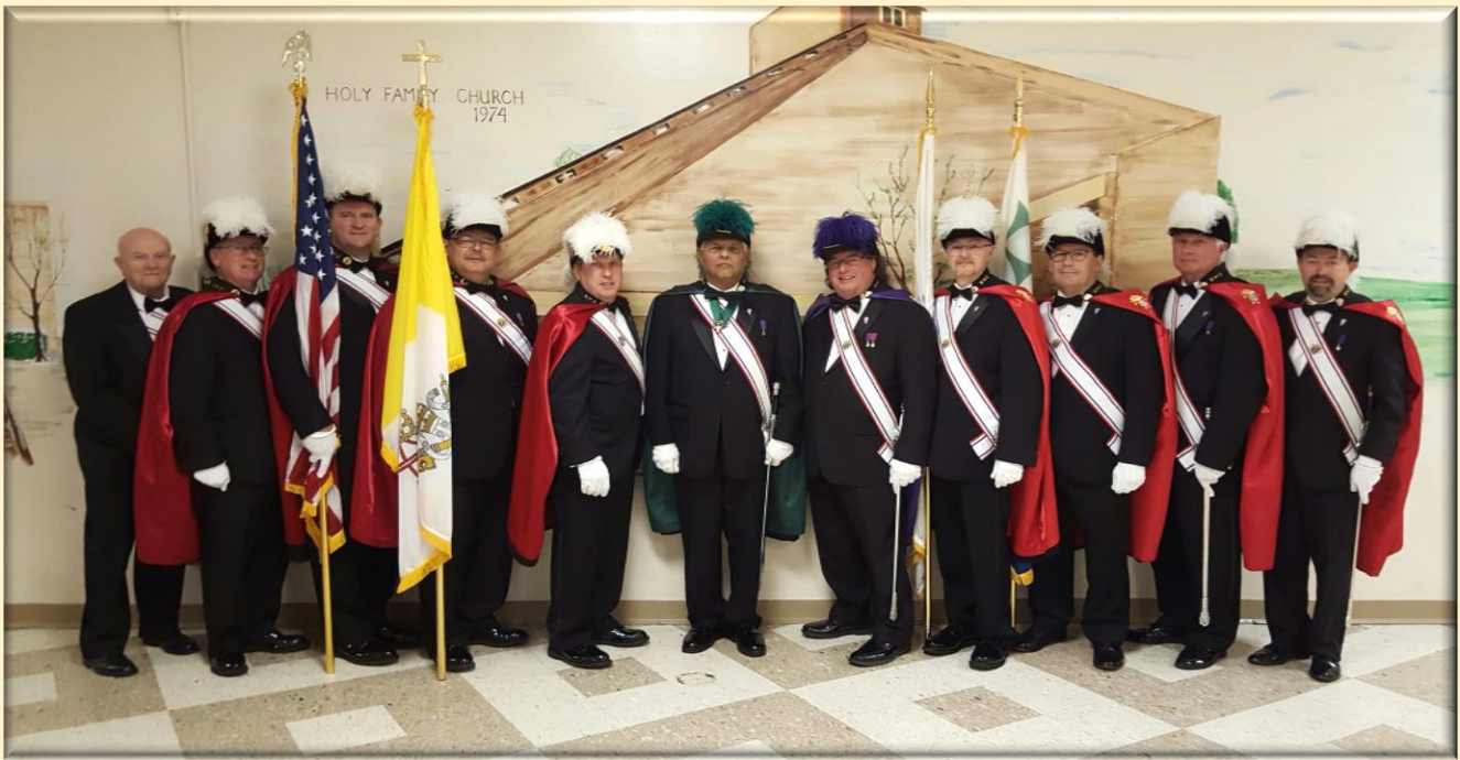
4 th Degree Exemplification Mass, October 29, 2016