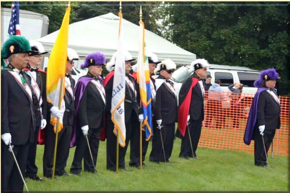
Corn Boil, Sugar Grove