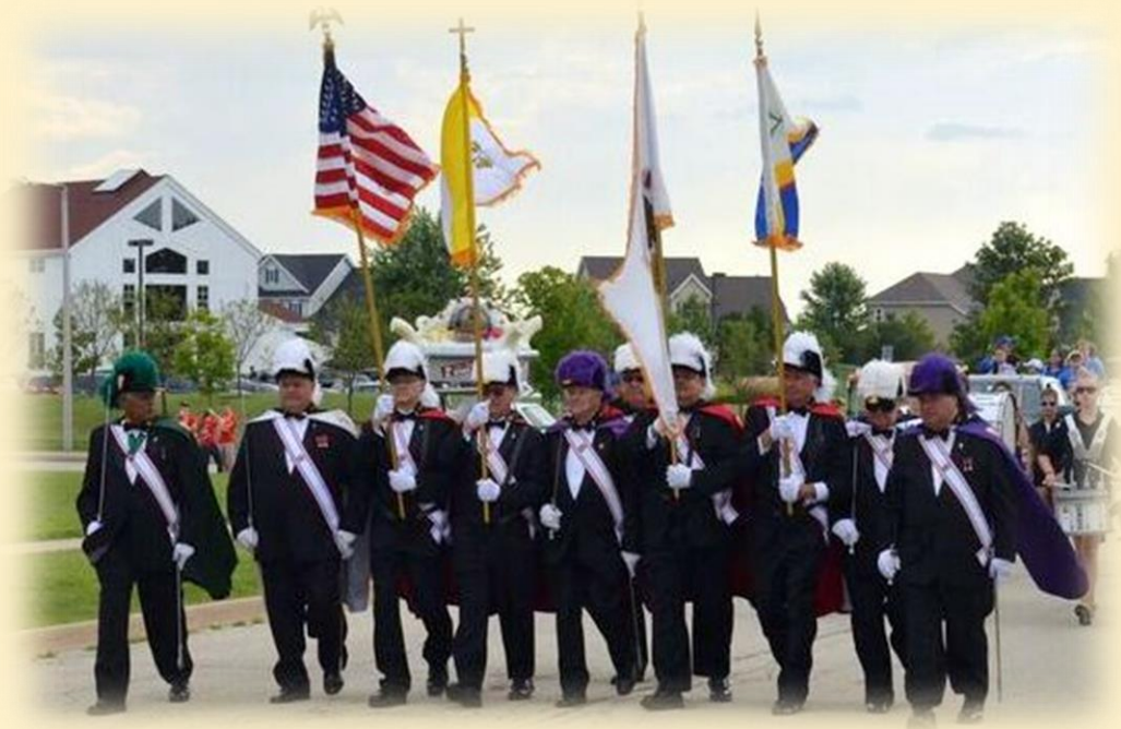
Corn Boil Parade, Sugar Grove